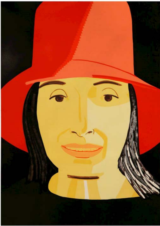
Alex Katz Red Hat Ada , 2015 Meyerovich Gallery