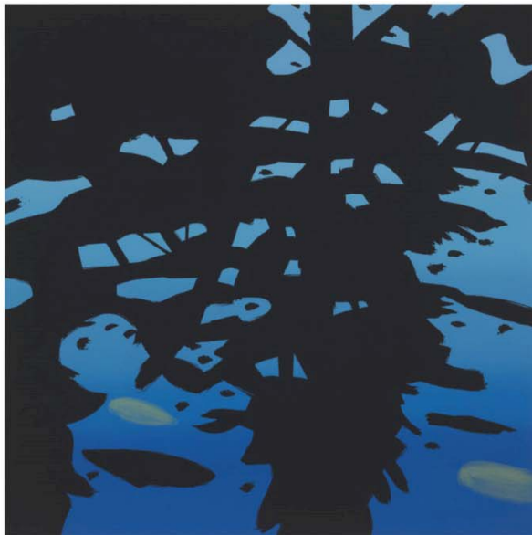
Alex Katz Reflection , 2010 Meyerovich Gallery

Though born 25 years apart, Alex Katz and Deborah Kass share deep ties to the New York City art scene. Both artists have been heavily influenced—whether through adoption or dismissal—by Pop Art aesthetics. This month, works from each artist are on view together at Meyerovich Gallery in San Francisco, where it's possible to trace the vast historical ripples of a controversial arts movement nearly 70 years after its birth.